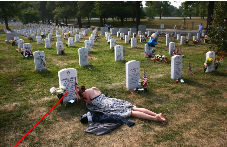
NOT ALL ARE SOLDIERS